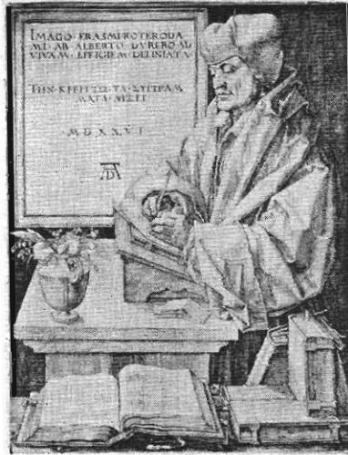
Albrecht Durer: "Erasmus"

Part B. After your class discussion of the period, write a paragraph that includes your thesis about the role of man in Renaissance society, supporting evidence from the pictures, and a conclusion that demonstrates the significance of the Renaissance in the development of Western civilization.