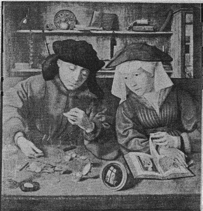
Quentin Massys: "A Money Changer and His Wife"